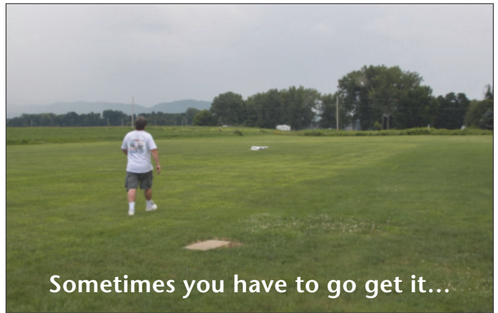
Sometimes you have to go get it...